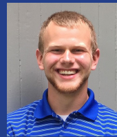
Abbott Joy Grace College

Every summer, we happily open our doors to meet recipients, learn about their studies and interests, and share history about the Phillips family.