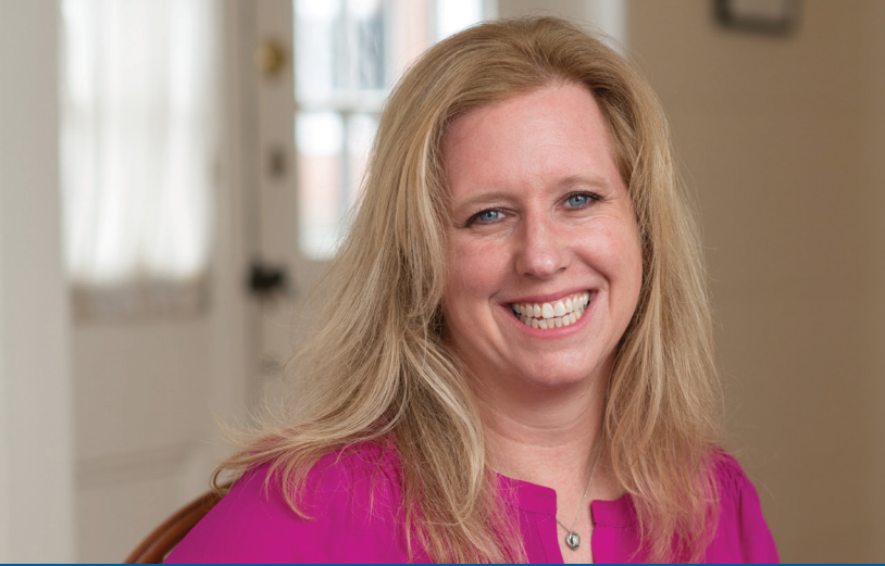
THE SALEM FIVE BRIGHT MINDS SCHOLARSHIP was created by the Salem Five Charitable Foundation as part of its commitment to giving back to the communities it serves.